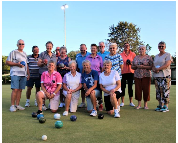
Featured above is a group of Tuesday night social bowlers recently enjoying the comradery and comfort of bowling with friends during the coolness of evening.

Back in the old days playing lawn bowls at night would rarely have come up in conversation. In early 1980 the topic was first raised and investigated but a new tif dwarf green was deemed of higher importance. Finally in 1989 one green was officially illuminated with Nambour becoming one of the first clubs on the Sunshine Coast to herald in the new era.