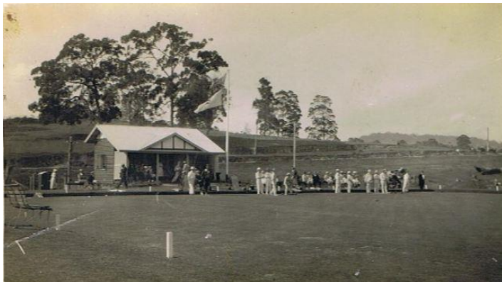
Nambour Bowling Club in 1933 Looking north with Showground Hill at the rear

We encourage members to display similar excitement with hands-on support this year as we set about promoting the game, stimulating membership and celebrating the Club's amazing achievements and service to the local community.